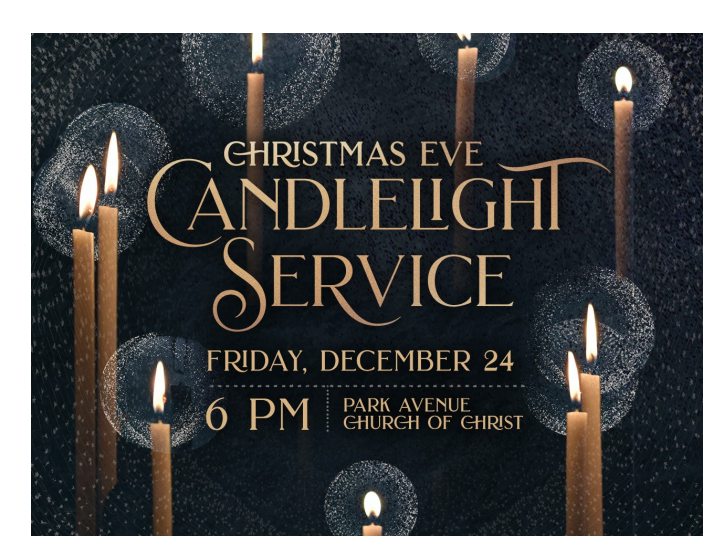
Join us Christmas Eve for this special service.

Christmas is the celebration that He did just that. Far away and long-ago God became man in a humble manger in the humble town of Bethlehem. He jumped into our messy world. And we are saved.